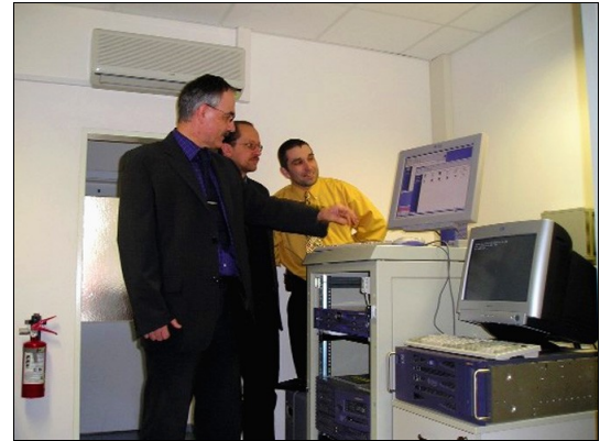
Deployment at the SFŽP

The State Environmental Fund of the Czech Republic is a special-purpose institution serving as an important financial source for the support of measures aimed at the protection and improvement of the environment. The Fund is one of essential economic instruments used to fulfill obligations arising from international conventions on environmental protection and membership in the European Union. It is also an instrument used to implement the National Environmental Policy. The Fund employs approximately 150 persons.